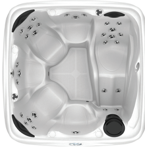
730 L WITH LOUNGE