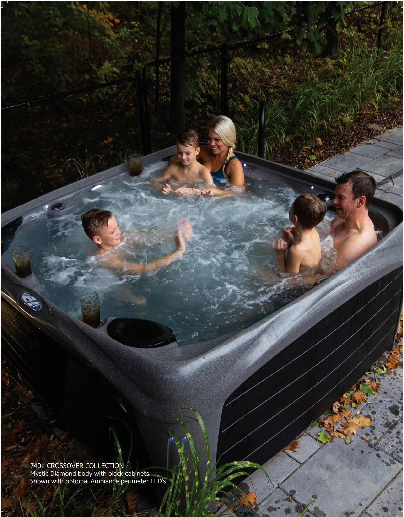
740L CROSSOVER COLLECTION Mystic Diamond body with black cabinets Shown with optional Ambiance perimeter LED's