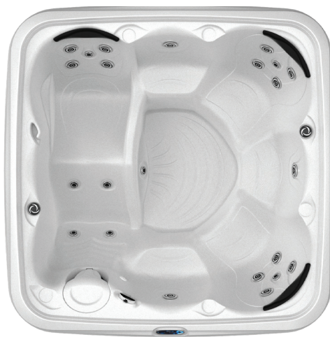
2300 L WITH LOUNGE

20 Stainless Steel Jets • 120V-15 amp, 1-Pump