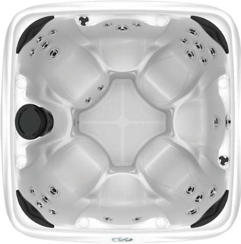
730 S ALL SEATS

30 Stainless Steel Jets • 120V-15 amp, 1-Pump