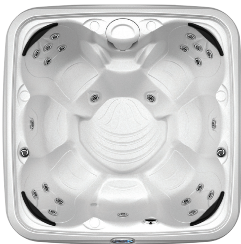
2300 S ALL SEATS

23 Stainless Steel Jets • 120V-15 amp, 1-Pump