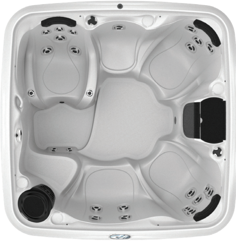
2500 S ALL SEATS

25 Stainless Steel Jets • 120V-15 amp, 1-Pump