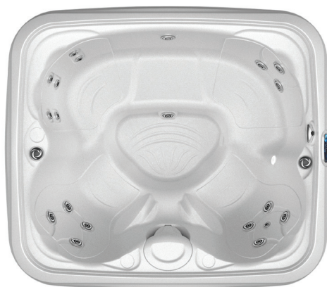
2000 S ALL SEATS

20 Stainless Steel Jets • 120V-15 amp, 1-Pump