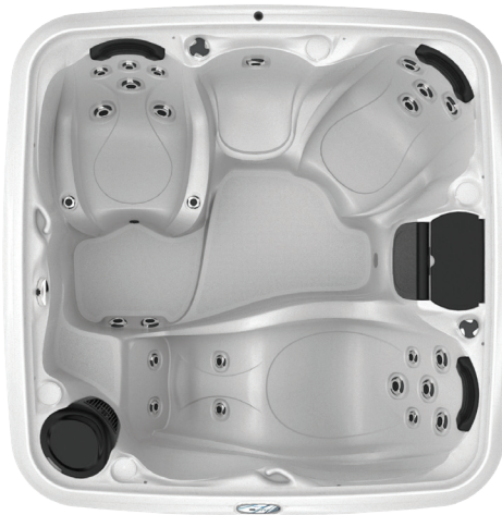
2500 L WITH LOUNGE