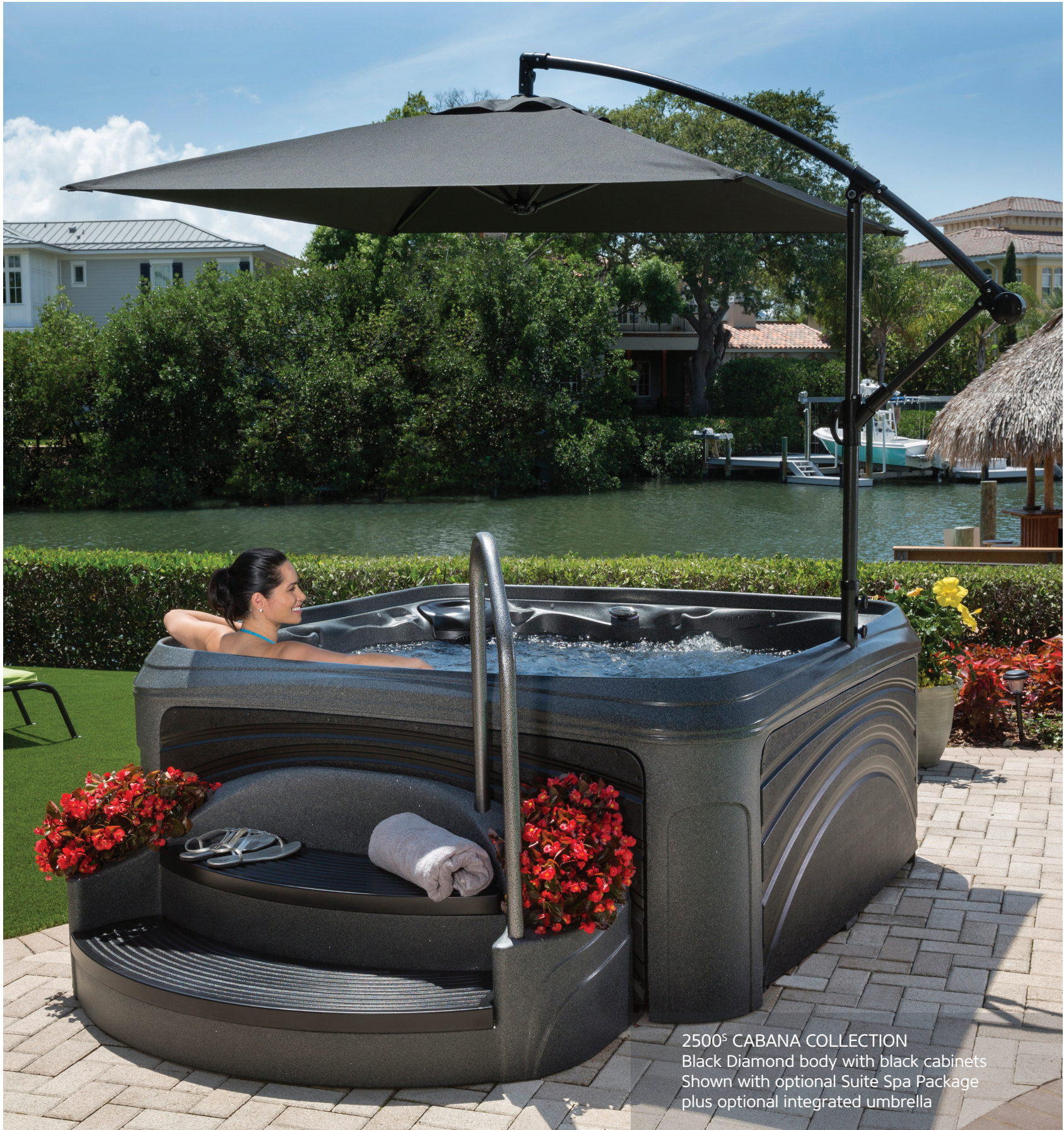
2500 S CABANA COLLECTION Black Diamond body with black cabinets Shown with optional Suite Spa Package plus optional integrated umbrella