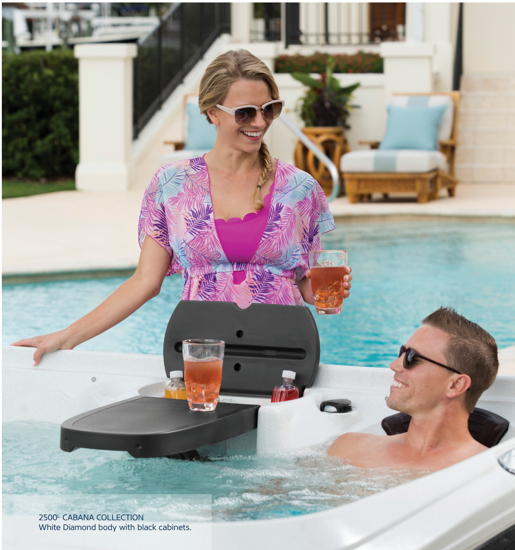
2500 L CABANA COLLECTION White Diamond body with black cabinets.