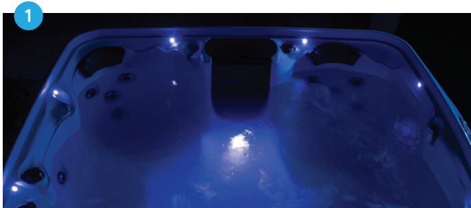
9 color options